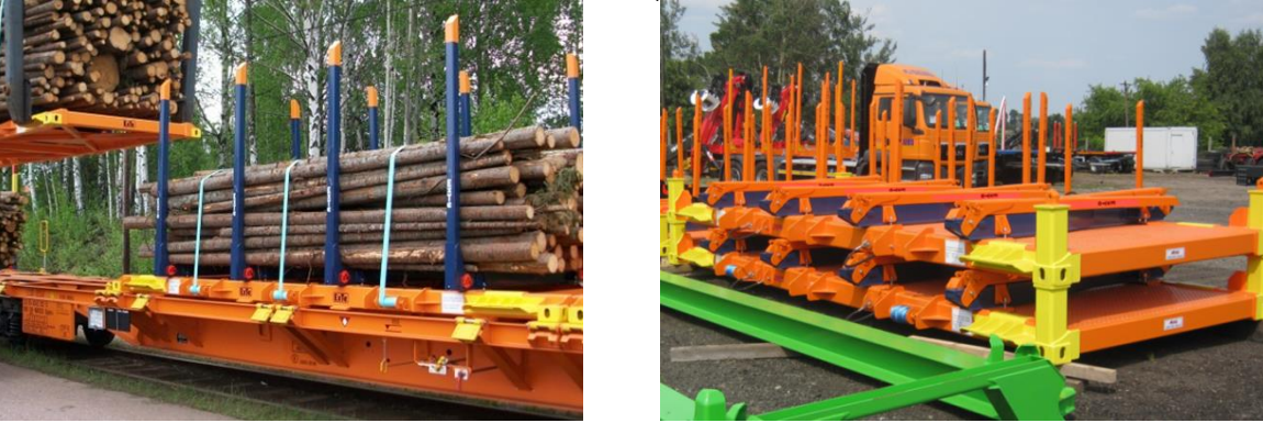
Figure 2: Timber Cassette 2.0