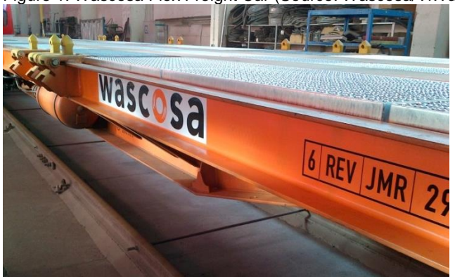
Figure 1: Wascosa Flex Freight Car

Together with Wascosa and ETH Zurich, a solution for a new type of wagon that meets the requirements for loading and unloading containers in sidings was developed. The "Flex Freight Car" is based on a classic container wagon (code Sgnss). Compared to standard KS wagons the wagons' floor is filled in with modular iron grids so that it is possible to remove the different parts of the grid as they are not permanently connected to the chassis. The wagon can be used as a classic container wagon for terminal-terminal transports where no floor is needed or - after a few modifications - it can be used to distribute sea containers into sidings. To test the wagon under realistic conditions SBB Cargo deployed the wagon in defined sidings.